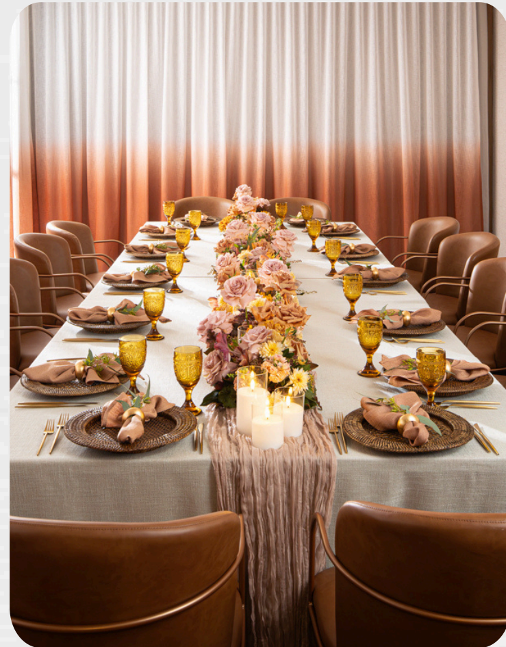
Private @ The Ternary

Take over The Ternary for an unforgettable event, with space for 600 cocktail guests or 180 seated.